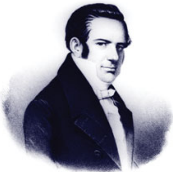
Johann Lukas Schönlein (1793–1864), a pioneer researcher of fungal disease.

worm but attributed it to infestation with small insects. They called the infection "tinea", which refers to small insect larvae. This attribution survives in the medical designations of the fungal diseases ringworm (tinea capitis), jock itch (tinea cruris),